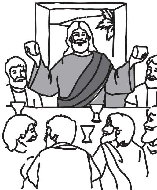
Jesus at the Last Supper