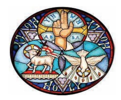
Most Holy Trinity

TODAY WE CELEBRATE Trinity Sunday. In the readings, we catch glimpses of some attributes of the Trinity. These glimpses can aid in our understanding of one of the mysteries of our faith and can inform our daily living.